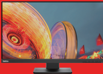
Accurate colors with 99% sRGB color gamut