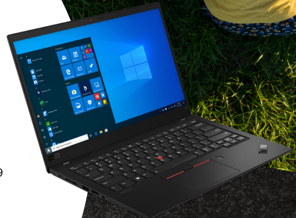
ThinkPad® X1 Carbon

We're committed to delivering energy-efficient products today and tomorrow. You'll find instant wake, and a long real-world battery life on Intel® Evo™ platform powered by Intel® Core™ vPro® processors used in Lenovo ThinkPad® laptops like the X1 Carbon. In addition, Lenovo laptops will be 30% more efficient by 2030. 2