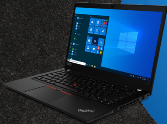
ThinkPad P14s / Gen2 Mobile Workstation

Technical debt accumulates when you attempt to solve one security issue at a time with solutions that weren't designed to work together. Customizable, end-to-end solutions reduce sunk costs and create new cost efficiencies.