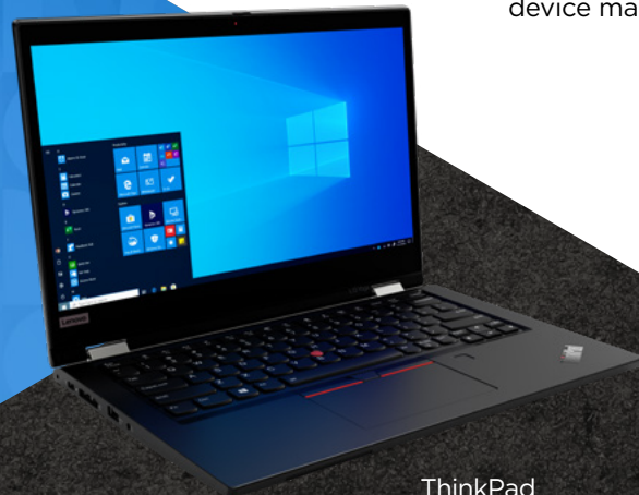
ThinkPad L13 Yoga

Every step of the manufacturing process is controlled, audited, and tamper-proof from our facility to your employees' desks.