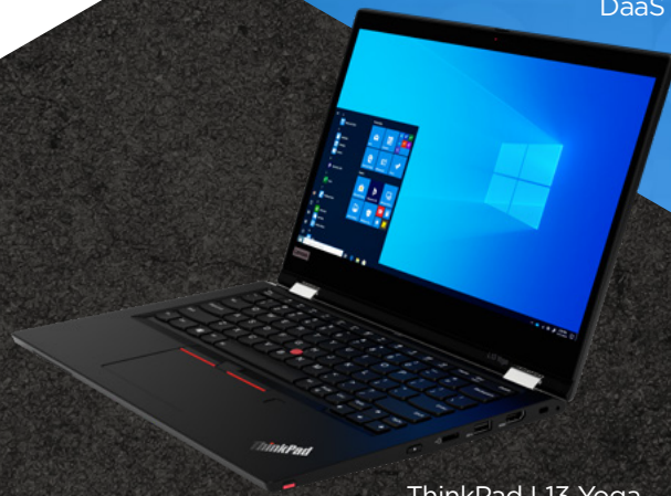
ThinkPad L13 Yoga