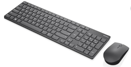
Lenovo Professional Ultraslim Wireless Combo Keyboard and Mouse