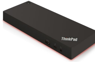
ThinkPad® Thunderbolt™ 3 Workstation Dock Gen 2