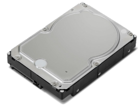
4TB Enterprise HDD