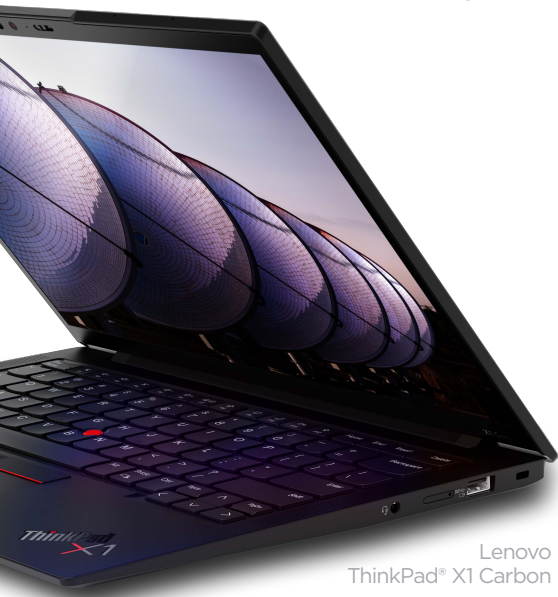
Lenovo ThinkPad® X1 Carbon

Lenovo is committed to achieving net-zero greenhouse gas emissions by 2050 , with targets validated by the Science Based Targets initiative (SBTi) b Net-Zero Standard.