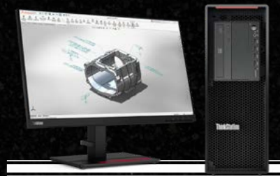
Lenovo ThinkStation P520 with ThinkVision P24q Monitor

The impressive processing ability of the Lenovo ThinkStation P920 gives it the extra capacity to run high-demand graphics programs, including VR, using NVIDIA Quadro RTX GPUs.