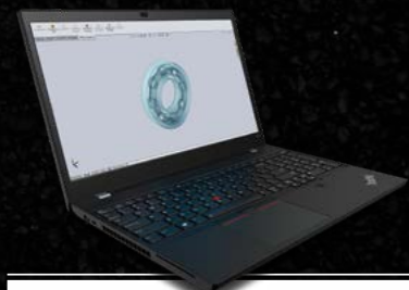
Lenovo ThinkPad P15v

Lenovo and Aston Martin are committed to the smarter pursuit of perfection. As the scope of practical, functional design is extended by a culture of constant innovation, Lenovo Workstations and Aston Martin are ready to take on the next generation of business.