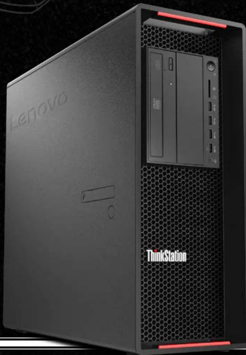
Lenovo ThinkStation P720

“The Lenovo Performance Tuner allows us to easily keep the profiles changing and adapting to the applications that the designers and engineers are running. Not only are we confident that our workstations are the most up-to-date that they’ve ever been, but I can’t remember the last time I’ve had a complaint from engineering or design in the last three or four years since we standardized on Lenovo.”