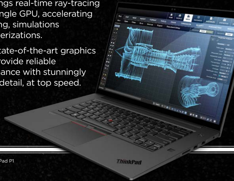
Lenovo ThinkPad P1

These state-of-the-art graphics cards provide reliable performance with stunningly precise detail, at top speed.