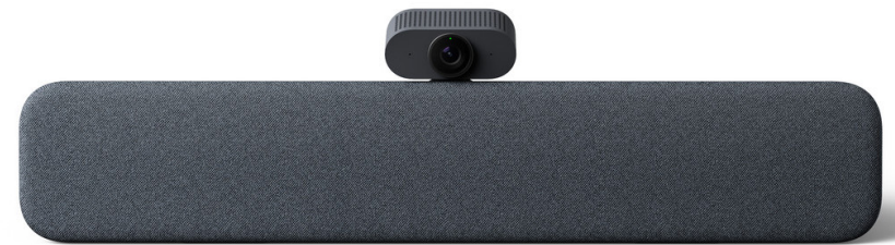
Smart audio bar

These ready-made solution kits transform any space into an inclusive, hybrid classroom where everyone contributes and every voice is heard.