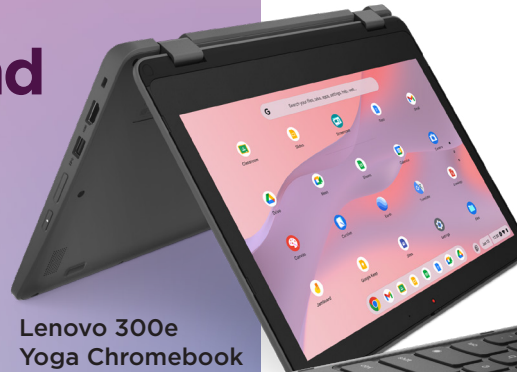
Lenovo 300e Yoga Chromebook Gen 4

philonedtech.com/results-from-top-hats-covid-19-faculty-survey-about-online-teaching/