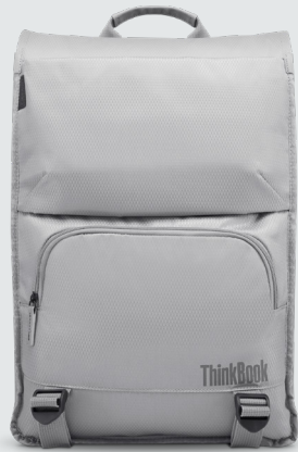
THINKBOOK URBAN BACKPACK PN: 4X40V26080

A multi-functional backpack with an anti-theft pocket ensures security on the move. The padded laptop compartment offers cushioned comfort, while the high-quality fabric and stylish PU leather accent add to the contemporary design.