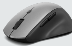
THINKBOOK WIRELESS MOUSE PN: 4Y50V81591

A multi-functional backpack with an anti-theft pocket ensures security on the move. The padded laptop compartment offers cushioned comfort, while the high-quality fabric and stylish PU leather accent add to the contemporary design.