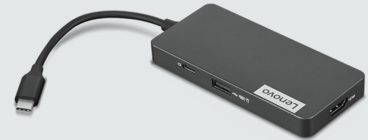
LENOVO USB-C 7-IN-1 HUB PN: GX90T77924

With dedicated volume control side buttons, on-the-fly DPI adjustment, and an ergonomic design, the ThinkBook Mouse is built for productivity. Also built-in are six separate control buttons, a 2-level scroll wheel, and room for a 1AA battery that can power your mouse for one year.