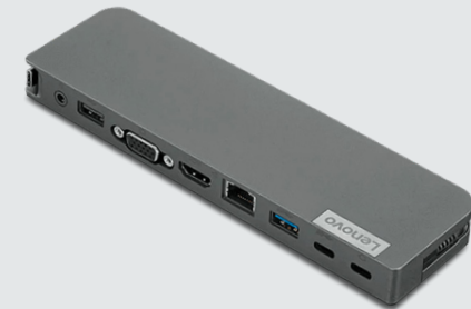
LENOVO USB-C MINI DOCK PN: 40AU0065US

With dedicated volume control side buttons, on-the-fly DPI adjustment, and an ergonomic design, the ThinkBook Mouse is built for productivity. Also built-in are six separate control buttons, a 2-level scroll wheel, and room for a 1AA battery which can power your mouse for one year.