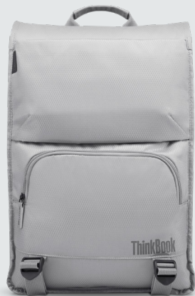
THINKBOOK URBAN BACKPACK PN: 4X40V26080

A multi-functional backpack with an anti-theft pocket ensures security on the move. The padded laptop compartment offers cushioned comfort, while the high-quality fabric and stylish PU leather accent add to the contemporary design.