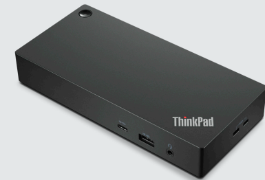
THINKPAD UNIVERSAL USB-C DOCK PN: 40AY0090IN

Modern, low-profile, with an ambidextrous design and silent buttons, this mouse is a must-have premium accessory for your laptop. Sculpted to be comfortable while holding and equipped with a blue optical sensor with track-on-glass compatibility, this mouse works effortlessly even on a glossy surface. Dual-host Bluetooth connectivity (with Microsoft Swift Pair) and 2-way scroll with on-the-fly DPI adjustment to up to 2400 give you more precision and control.