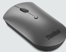
THINKBOOK BLUETOOTH SILENT MOUSE PN: 4Y50X88824

A multi-functional backpack with an anti-theft pocket ensures security on the move. The padded laptop compartment offers cushioned comfort, while the high-quality fabric and stylish PU leather accent add to the contemporary design.