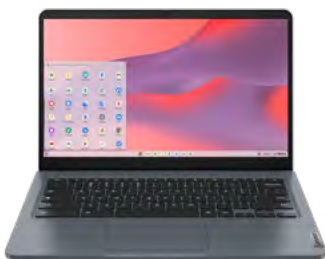
Lenovo 14e Chromebook Gen 3 (Includes NetFilter and LanSchool)