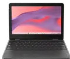
Lenovo 300e Yoga Chromebook Gen 4