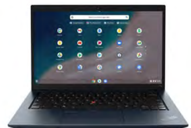
Lenovo ThinkPad C14 Chromebook Powered by Intel (Includes Parallels instead of NetFilter)

This bundle is designed to help teachers fully utilize the latest technology of their Lenovo Chromebooks and create interactive and engaging lesson plans, manage their classrooms effectively, and access professional development resources. This bundle will allow teachers to get the most out of their Lenovo Chromebooks and improve the learning experience for their students. Teachers can contact their Lenovo representative for more information and to purchase this bundle.