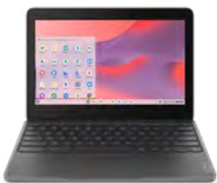
Lenovo 100e Chromebook Gen 4