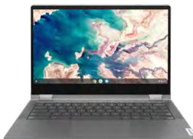
Lenovo Flex 5i Chromebook (Includes Parallels instead of NetFilter)