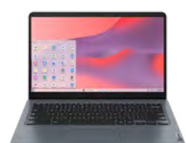
Lenovo 14e Chromebook Gen 3

This comprehensive package is designed to help schools provide students with the tools they need to succeed in a digital learning environment, and to ensure that the school is running smoothly and efficiently. Interested schools can contact their Lenovo representative for more information and to purchase the bundle.