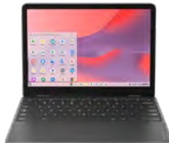
Lenovo 500e Yoga Chromebook Gen 4