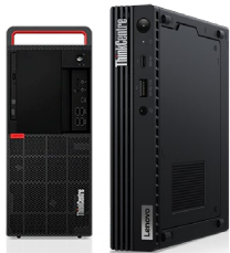
ThinkCentre M Series