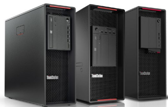
ThinkStation P520, P720, & P920