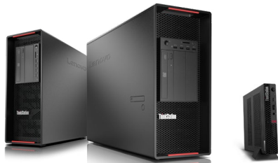
P3XX Series Tower, SFF, & Tiny