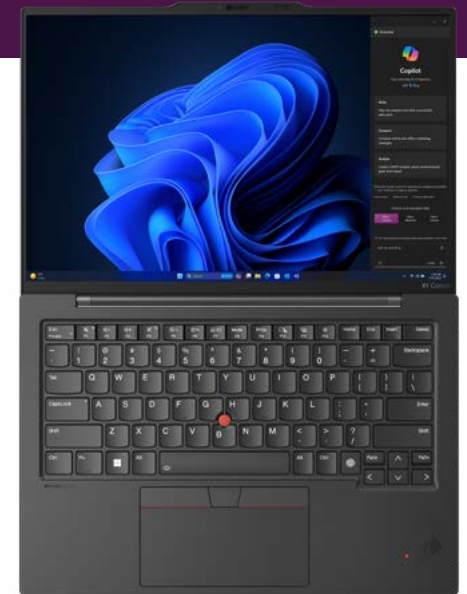
Lenovo ThinkPad X1 Carbon