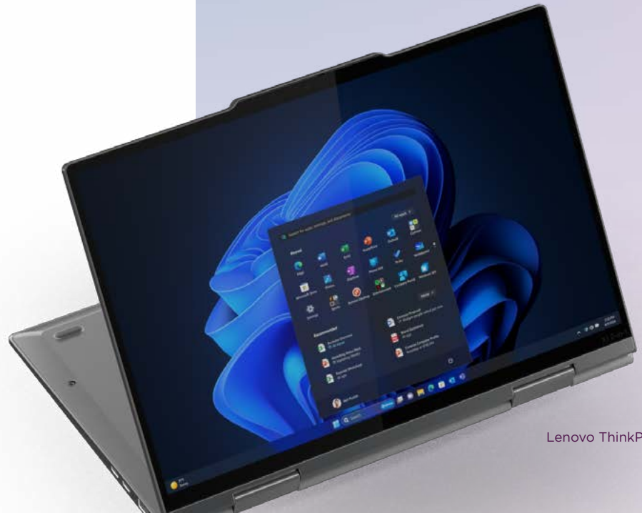
Lenovo ThinkPad X1 2-in-1

End-to-end security for organizations. Powerful built-in security including hardware-based isolation, encryption, and malware protection. Cloud configuration simply secures a Windows 11 device for curated apps and access. App compatibility and cloud management make adoption easy.