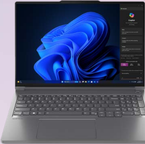
Lenovo ThinkBook 16p

This ThinkBook offers higher performance capability with dedicated graphics support and AI features from Microsoft Copilot for demanding tasks.