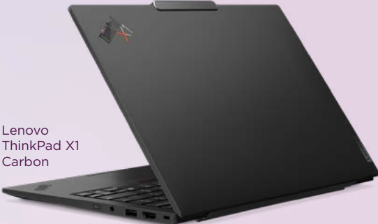
Lenovo ThinkPad X1 Carbon

Lenovo recommends Windows 11 Pro for Business.