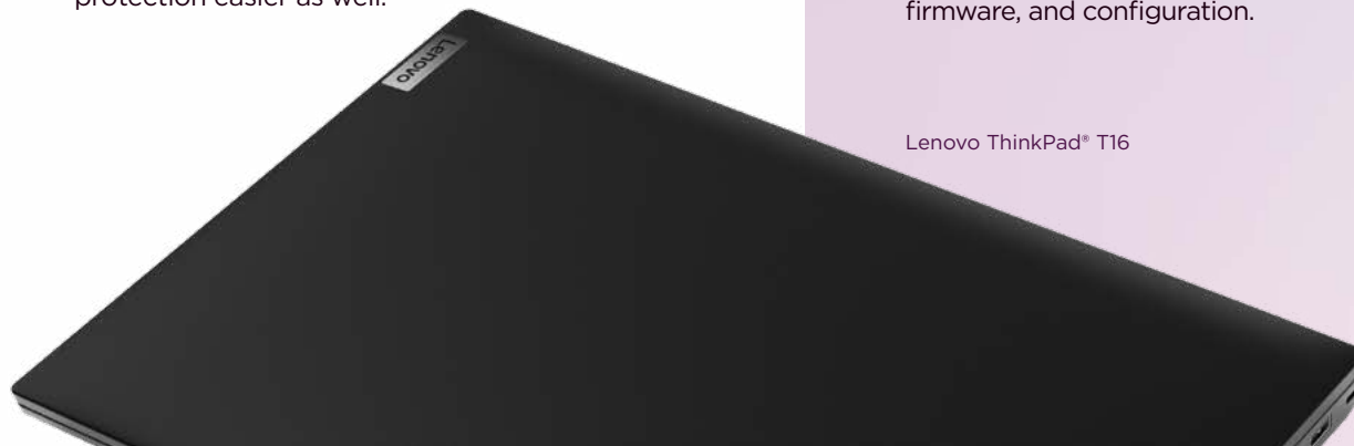
Lenovo ThinkPad® T16

Lenovo recommends Windows 11 Pro for Business.