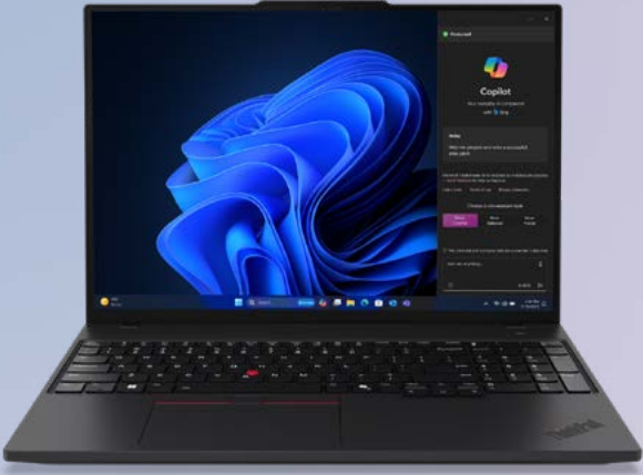
Lenovo ThinkPad T16