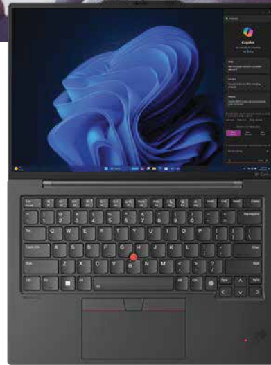
Lenovo ThinkPad X1 Carbon

Lenovo recommends Windows 11 Pro for Business