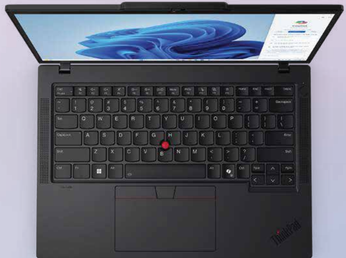
Lenovo ThinkPad T14

© Lenovo 2024. All rights reserved. v1.00 May 2024.