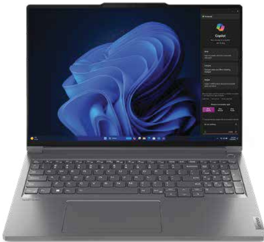
Lenovo ThinkBook 16p

These features help you avoid phishing-related identity compromises. But they are just part of what the zero trust-ready Windows 11 offers to raise your security profile — from mission critical application safeguards to Windows Firewall to silicon-assisted secure kernel.