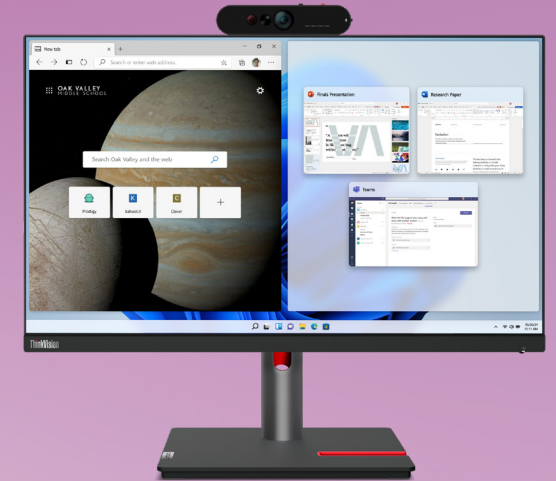
ThinkVision® P24q-30 Superior image quality

The high resolution and easy connectivity make this stunning 27.0" display ideal for the evolving learning environment. It delivers a premium functional and ergonomic experience with an impressive four-side near-edgeless anti-glare screen for all-day creativity and discovery.