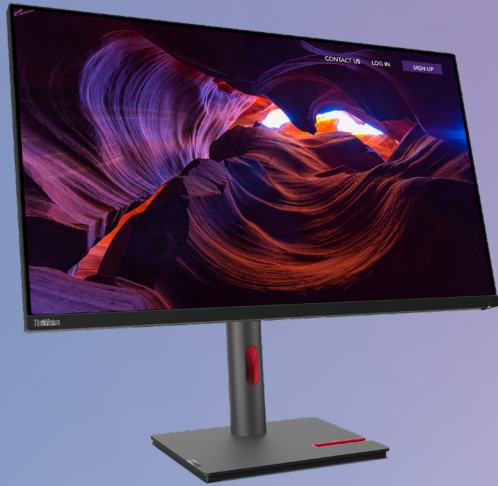
ThinkVision® P32p-30 Bring big ideas to life

Learn with pixel-perfect clarity with this 4K UHD resolution screen, delivering a 99% accurate sRGB color gamut. The three-side, near-edgeless screen and 178°/178° viewing angles enhance collaboration wherever class is in session.