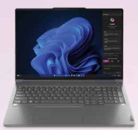
Lenovo ThinkBook 16p

This ThinkBook offers higher performance capability with dedicated graphics support and AI features from Microsoft Copilot for demanding tasks.