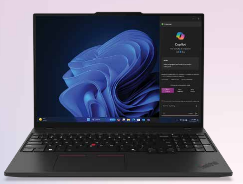
Lenovo ThinkPad T16

Lenovo and Windows 11 are hybrid work's dynamic duo. Planning your company's upgrade today is a smart IT strategy.