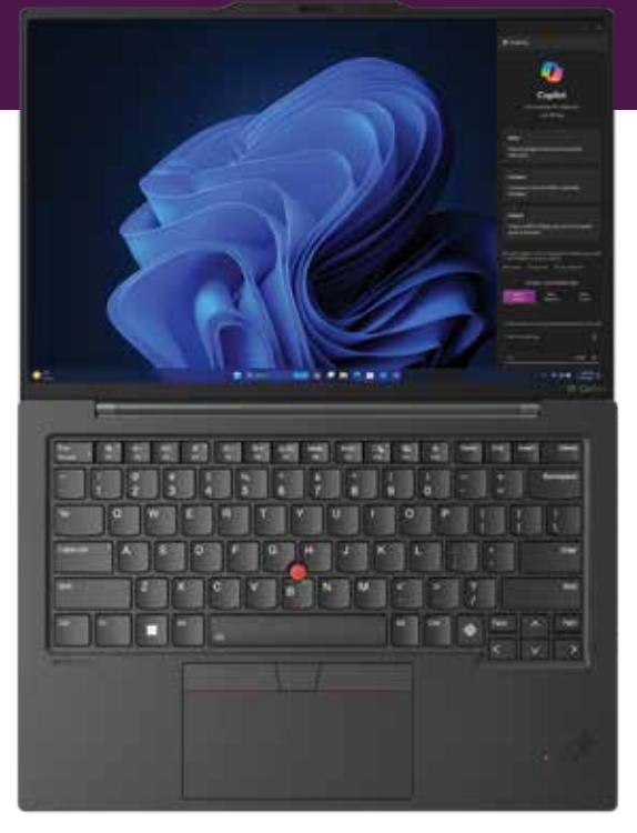
Lenovo ThinkPad X1 Carbon

Prepare the smarter way and pave a path towards Al-enhanced productivity and security with Windows 11 and Lenovo devices. Contact your Lenovo sales representative today to get started. Learn more.