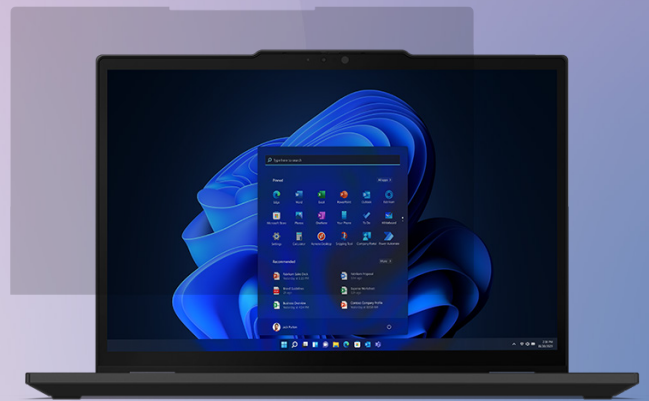
ThinkPad X13 Yoga Gen 4 PN: 4XJ1K79629*