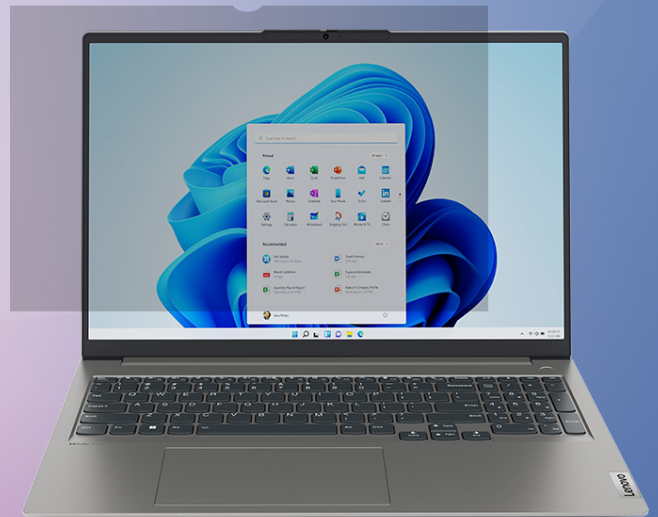
ThinkBook 16 Gen 4 PN: 4XJ1K79633*