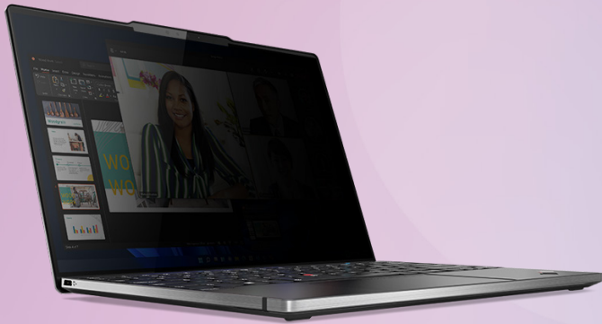
ThinkPad Z13 PN: 4XJ1K79627*

An anti-reflective coating to minimize glare.