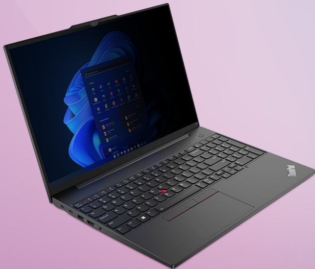
ThinkPad E16 Gen 1 PN: 4XJ1K79631*