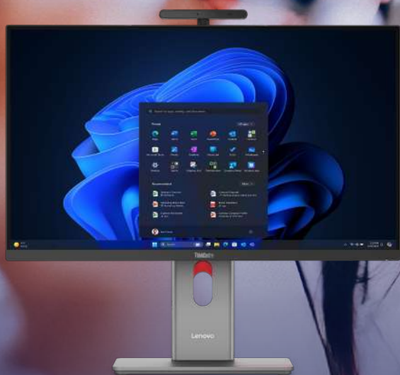
Lenovo ThinkCentre M90a