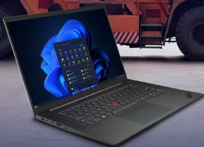
Lenovo ThinkPad P1 Gen 6