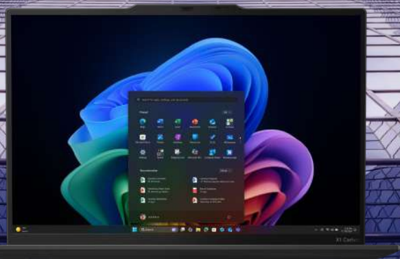
Lenovo ThinkPad X1 Carbon Gen 13 Aura Edition