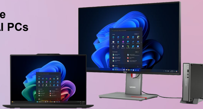
Lenovo ThinkPad X1 Carbon Gen 13 Aura Edition