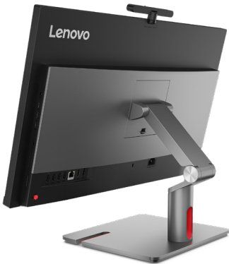
Ultra-Flex V Stand