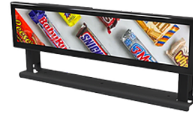
Top displays on lower aisle dividing shelving systems