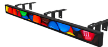
Shelf strip displays for the front of standard shelves