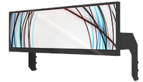
Header displays for the top of standard shelving systems